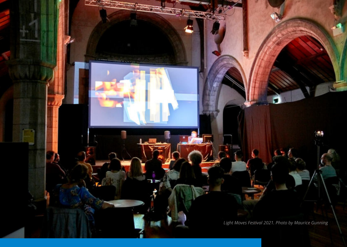
Light Moves Festival 2021.